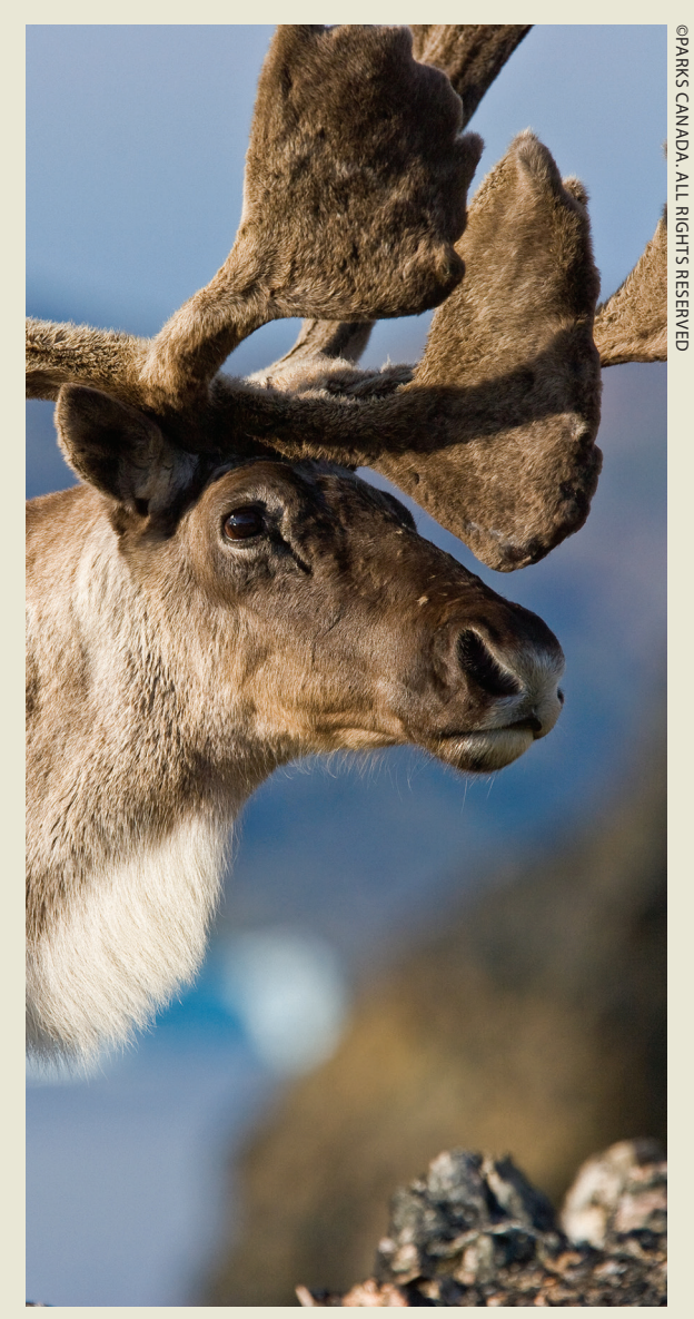
Caribou at Ramah Bay, Torngrat Mountains National Park, Canada.

NAWPA products and additional information about the Committee are available at nawpacommittee.org.