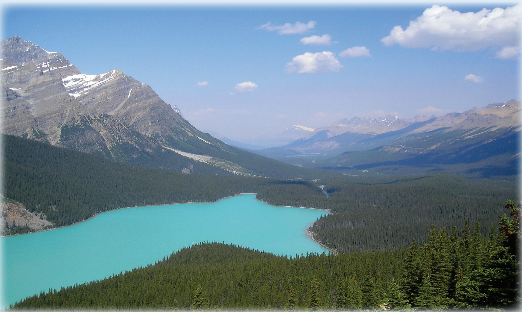
Banff National Park, Parks Canada

“The degradation and loss of wetlands is more rapid than that of other ecosystems. Similarly, the status of both freshwater and coastal wetland species is deteriorating faster than those of other ecosystems.”